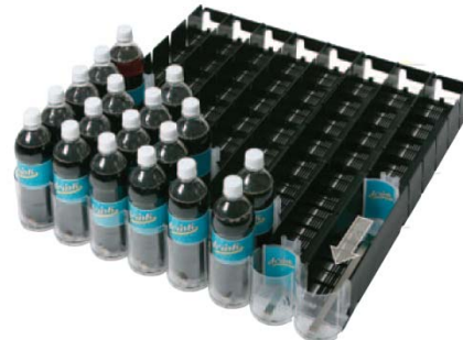
BEV-TRAC SPRING-FEED LANE DIVIDERS

Additionally, our Bev-Trac Spring-Feed Merchandiser Lane Dividers remain available. Pricing and specifications are attached on page 2 of this memo.